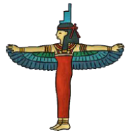
Isis Mother Goddess, Goddess of Protection and Healing